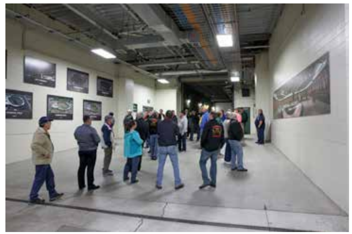
Everyone is viewing the pictures of the 4 times Lambeau Field was remodelled. In the distance is the tunnel that the Packers take when they enter for Game Day.