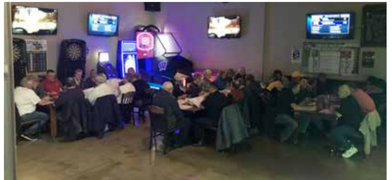
Everyone enjoy a great meal at The Distillery in Green Bay after the tour.